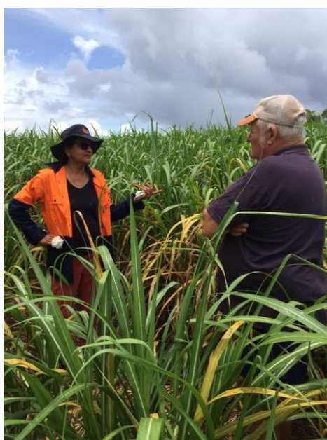
Priya-SRA researcher discusses leaf symptoms with grower.