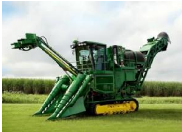
A clean harvester